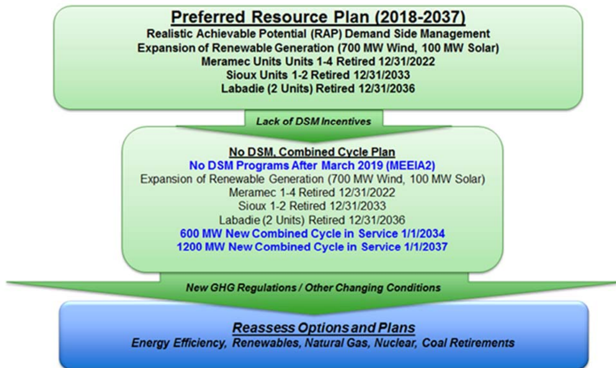
Figure 10.3 Preferred Plan and Contingency Plans